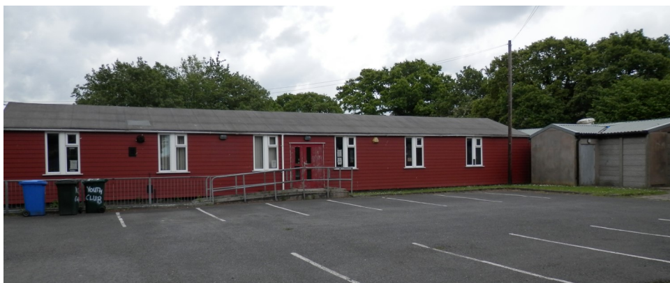
Eccleston Youth Centre circa 2017